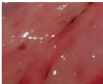
Fig. 1 Section through gastric Mucosa of control rat.

In 4hr Pylorus – ligated rats, TI (200 and 400 mg/kg b.w) was showed a dose – dependently decreased the gastric Juice volume and gastric acid output, omeprazole also showed significant (P<0.001) reduction in concentration and output of acid secretion in pylorus ligated rats. The values were shown in Table (3).