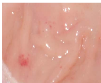
Fig. 2 Section through gastric Mucosa of rat treated with Omeprazole 10 mg/kg.