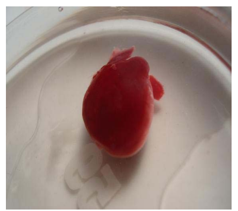
Fig 1: Showing ischemic zone in (1A): Sham operated rat heart and (1B): Ischemia and reperfused rat heart (1C): Ascorbic acid treated rat heart after 2, 3, 5 triphenylterazolium chloride staining. Ischemic zone marked with blue lining