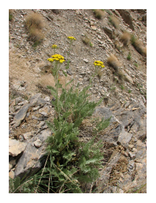
Figure 1. Arial parts of Achillea wilhemsii C. Koch.