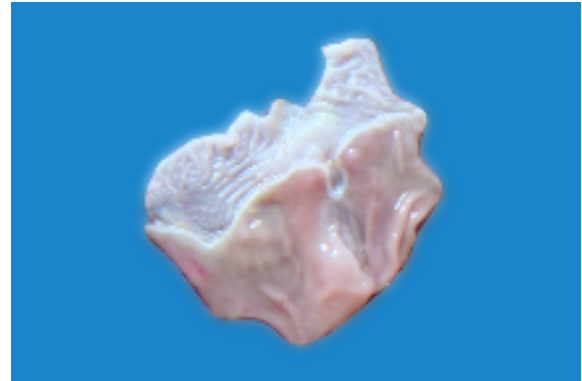
2 b) Standard Ranitidine shows protection in mucosal layer