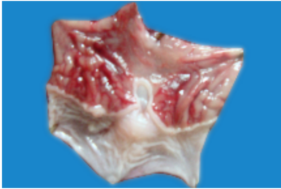
2 a) Control shows severe damage in mucosal layer