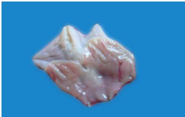
2 c) ETC 50 mg/kg shows protected mucosal layer