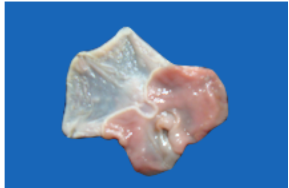
1 b) Standard Ranitidine shows protection in mucosal layer