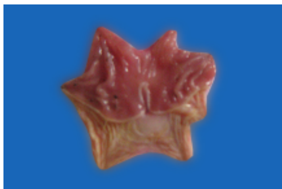
3 c) ETC 50 mg/kg shows protected mucosal layer