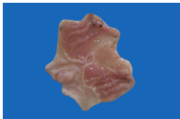
3 d) ETC 100 mg/kg shows protected mucosal layer