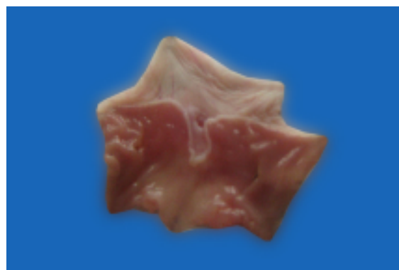
3 b) Standard Ranitidine shows protection in mucosal layer