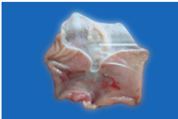
1 c) ETC 50 mg/kg shows protected mucosal layer