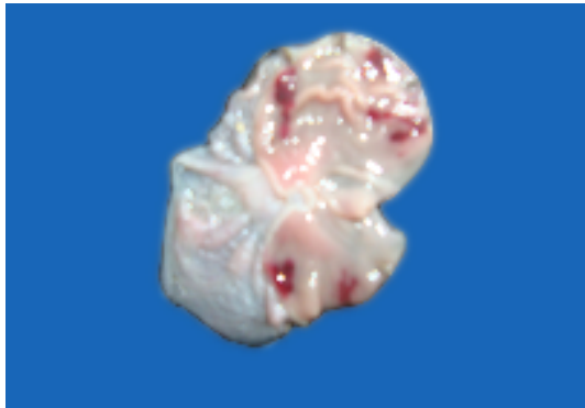
1 a) Control (PL) shows severe damage in mucosal layer