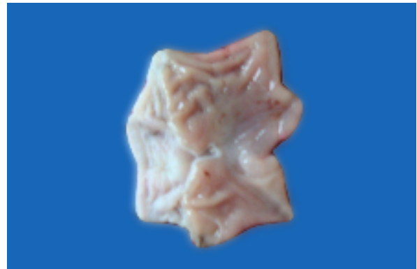
2 d) ETC 100 mg/kg shows protected mucosal layer