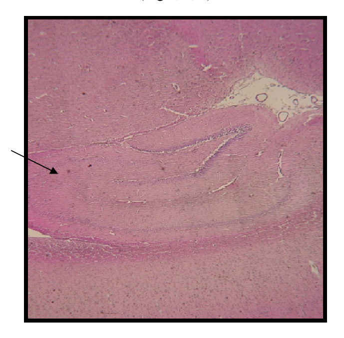
Fig.1.Photomicrograph illustrates neurons of the CA2 region of hippocampus at magnification of (20×). Spikes show the CA2.

The effects of Cannabis sativa extracts on the numbers of intact neurons in the CA2 region of hippocampus after one month in rats are shown in (Fig.1, 2, 3).