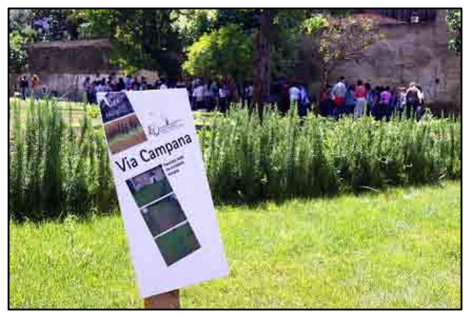
» The old via Campana of Orto di San Lorenzo

Article 1, paragraph 1: "The Campania Region enhances the Mediterranean diet, with UNESCO recognising it as an intangible cultural heritage as well as a development model based on the values of this type of diet and lifestyle from cultural, social, historical, culinary, food, environmental, landscape and customs perspectives";