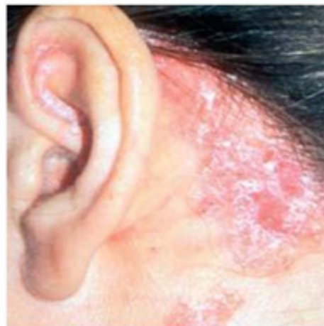
(7) Scalp psoriasis