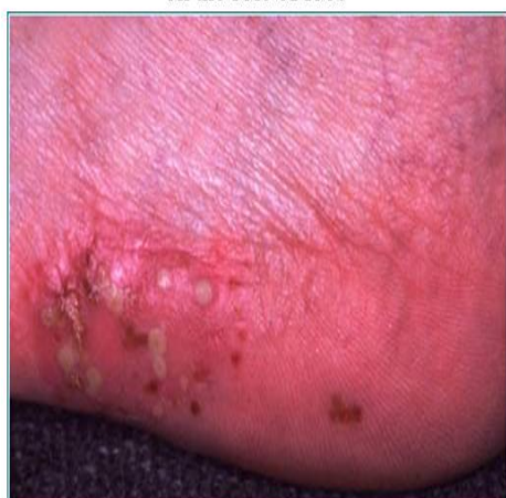
(4) b. Palmoplantar pustulosis on the sole of foot