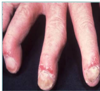
(2) Psoriatic arthritis