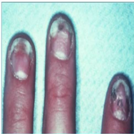
(6) Nail Psoriasis