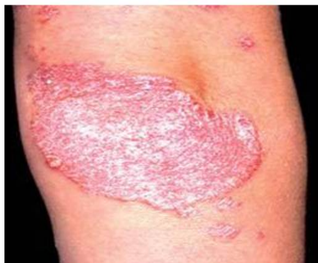
(1) Plaque psoriasis