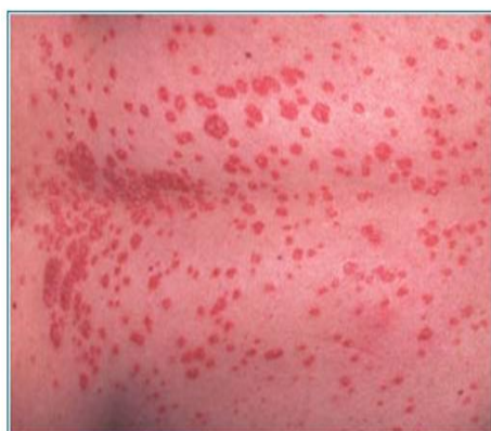
(3) Guttate psoriasis-on the back