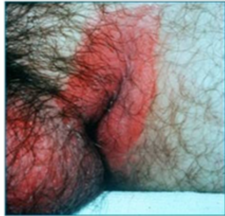
(5) Inverse psoriasis