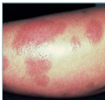
(4) a. Localized pustular psoriasis