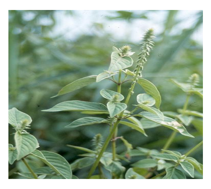
Figure: Achyranthes aspera Linn.

Achyranthes aspera is known as Apamarg in Sanskrit, Aghedo and Aghedi in Gujarati, Chirchira and Chirchitta in Hindi and Prickly chaff flower in English.