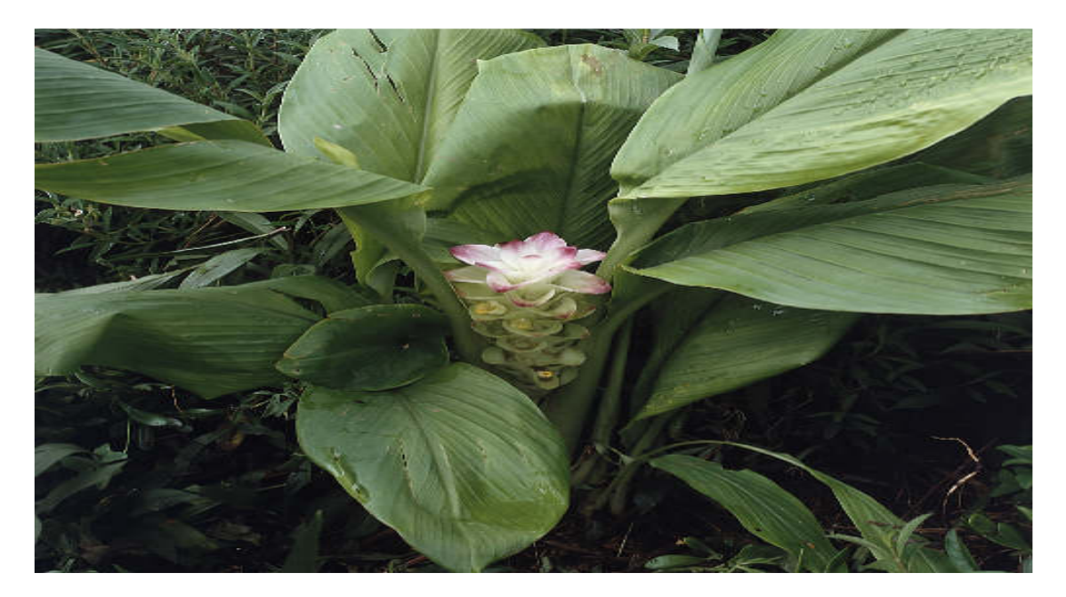
Figure: Curcuma aromatic

It is a wild plant, cultivated throughout India chiefly in Bengal and Kerala (Travancore). It is an erect, perennial herb. Rhizomes are large, tuberous, yellow or orange- red inside and aromatic in taste. Leaves are large, green, oblong-lanceolate/ oblong elliptic, with acuminate apex, 38-60 x 10-20 cm size, often variegated above, pubescent beneath, base deltoid with long petioles. Rootstock large, of palmately branched, sessile annulated biennial tubers. Flowering stem appears with or before the leafing stem, as thick as the forefinger and sheathed. Flowers are fragrant, shorter than the bracts, in spikes 15-30 cm long; flowering bracts 3.8-5 cm long, ovate, recurved, cymbiform, rounded at the tip, pale green, connate below forming pouches for the flower, bracts of the coma 5-7.5 cm long, more or less tinged with red or pink. Calyx 8 mm long, irregular with 3-lobed, corolla tube 2.5 cm long with upper half like funnel- shaped, lobes pale rose- coloured, the lateral lobes oblong, the dorsal longer, ovate, concave, arching over the anthers. Lip yellow, obovate, deflexed, subentire or obscurely 3- lobed. Lateral staminodes oblong, obtuse and as long as corolla- lobes<sup>3</sup>