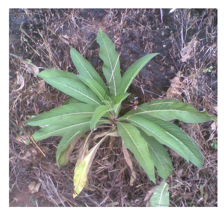
Figure 1. Lobelia nicotianaefolia Roth E & S

Indian Lobelia consists of dried roots and dried above ground parts of Lobelia nicotianaefolia Roth E & S , Family Lobeliaceae.