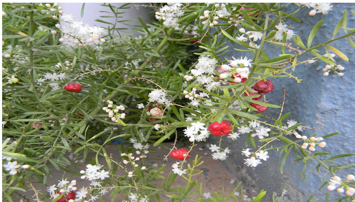
Figure 2: A. racemosus Willd

The plant belong to Kingdom: Plantae, clade : Angiosperms, clade : Monocots, Order: Asparagales, Family: Asparagaceae, Subfamily: Asparagoideae, Genus: Asparagu,s Species: A. racemosus .