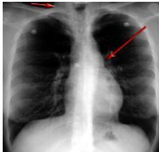
Fig 2: Chest X-ray of our patient

LEGEND: + - border of maxillary sinus, * - maxillary sinus ostium, U - uncinate process, E - ethmoid sinuses, IT- inferior turbinate, MT- middle turbinate, S - septum, C - concha bullosa.