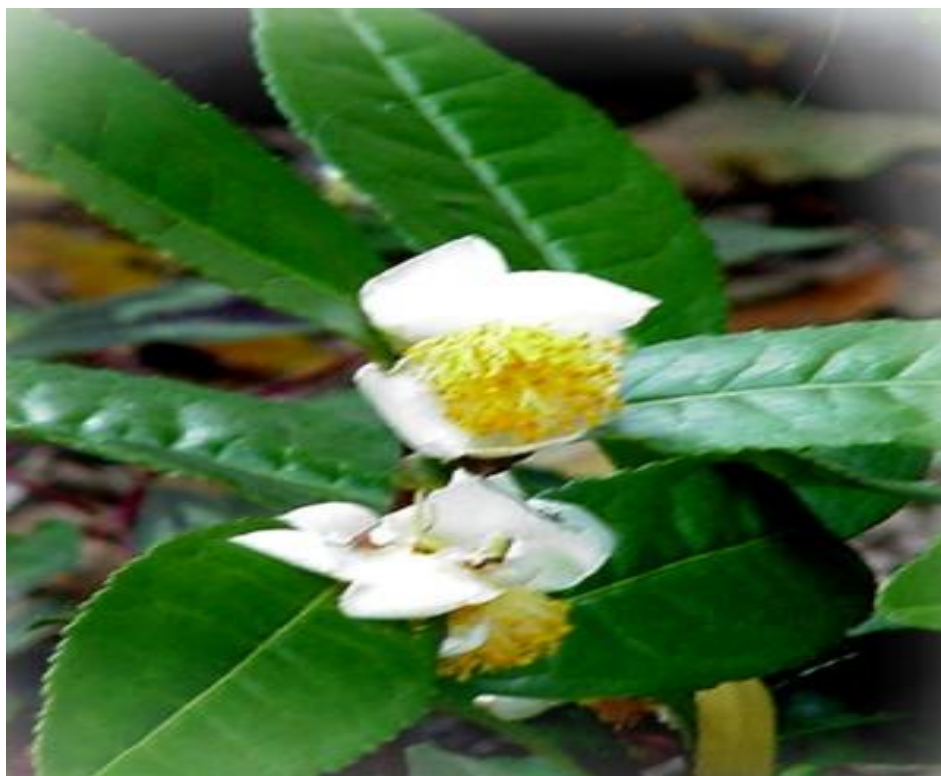
Figure: Camellia sinensis

Green tea derived from the leaves of the Camellia sinensis plant. Originally cultivated in East Asia, this plant grows as large as a shrub or tree. Today, Camellia sinensis grows throughout Asia and parts of the Middle East and Africa. People in Asian countries more commonly consume green and oolong tea while black tea is most popular in the United States. Green tea is prepared from unfermented leaves, the leaves of oolong tea are partially fermented, and black tea is fully fermented. 4